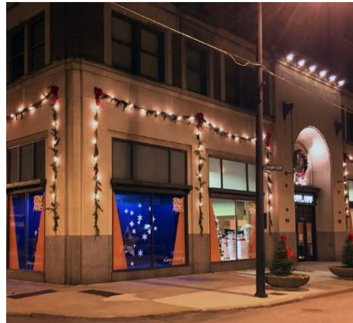
SMARTS Headquarters Ohio One, 25 East Boardman Street, First Floor Youngstown, OH 44503

SMARTS is the backbone and lead arts organization for Any Given Child, Warren, an initiative through the John F. Kennedy Center for the Performing Arts that provides students access and equity to quality arts education in the Warren City School District. SMARTS provides leadership, administration, arts integration expertise, and professional development. We have been working with the Warren City School District since 2015 through this initiative. Our teachers can be found in their schools nearly every day throughout the year.